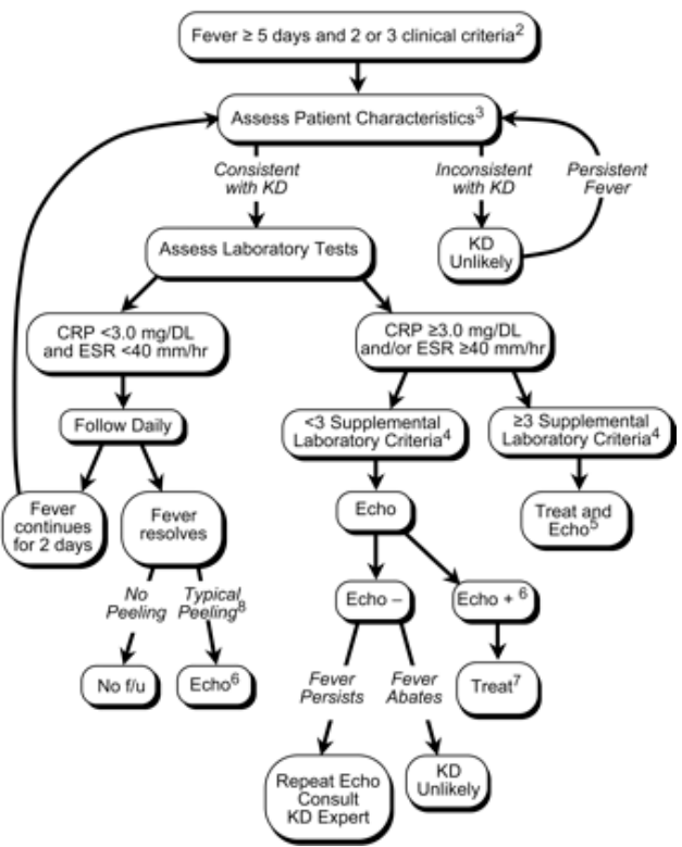
Figure 1. Evaluation of suspected incomplete Kawasaki disease.

of undiagnosed KD must be considered in young adult patients with aneurysms and early atherosclerotic lesions without significant family history or risk factors for early atherosclerosis<sup>17</sup>.